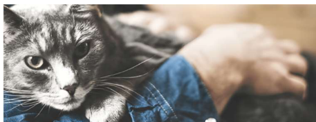
PROJECTS Manitoba Feline Protection Project