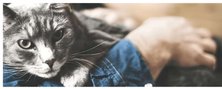
PROJECTS Manitoba Feline Protection Project