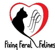
PROJECTS Manitoba Feline Protection Project